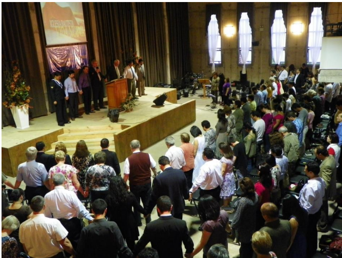
Dedication of the new Church Building, Nov. 4, 2012